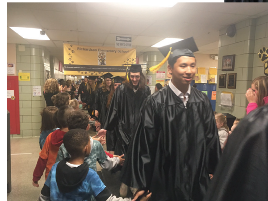
Graduating Seniors received high-fives and applause as they walked the halls of their old schools, one more time!